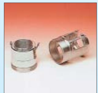
4EX/4ERX Series Stainless Steel Pump Ends