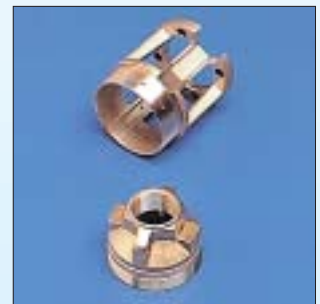
4E/4ER Series Bronze Pump Ends