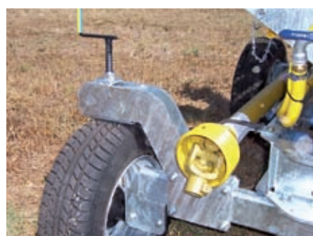
REAR WHEEL BRAKES: Optional bolt-on brakes, easy to retro fit, give independent braking on uneven terrain.