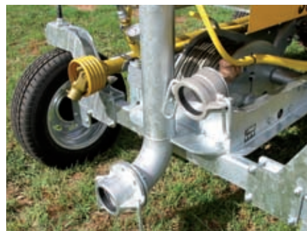
ANGLED HOSE CONNECTIONS: Inlet and hose purging connections are inclined to suit angle of hose for easy connection and to protect the hose.