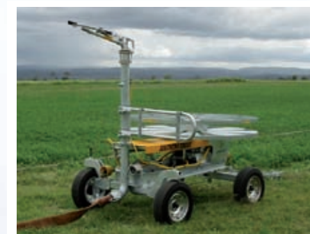
OH&S ASSESSED: Full product risk assessment completed by independent OH&S inspectors for user safety.