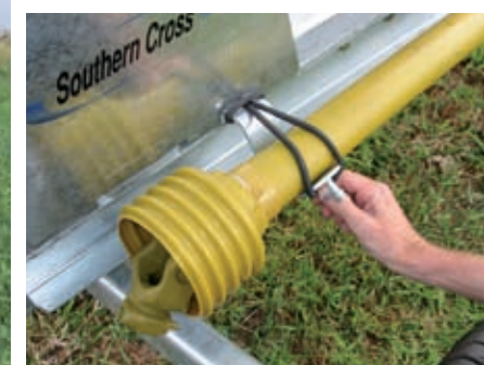
PTO SHAFT RESTRAINTS: Easy access PTO shaft carrier includes rubber retaining straps to hold shaft when towing irrigator.