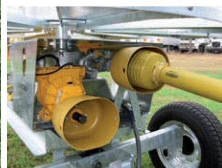
INDEPENDENT PTO DRIVES: Hose reel and purge use separate input shafts for added safety. PTO shaft fitted with safety guards.