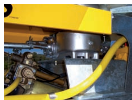
FULLY ENCLOSED GEARBOX: 52:1 ratio worm drive hose reel gearbox fully sealed and oil filled. Includes thermal expansion chamber.