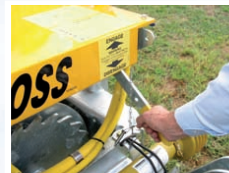
HOSE REEL LEVER: Easy access to hose reel engage / disengage lever for added operator safety and convenience.