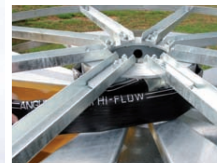
BOLTED DESIGN HOSE REEL: Made from smooth sheet for reduced hose wear. Inexpensive conversion from one hose size to another.

OPTIONAL EXTRAS: Rear wheel brakes, hose purging compressor (std. on SX2500F & all SX3500 models), horizontal hose guide roller, high flotation tyres (10.5 inch wide x 15 inch rims).