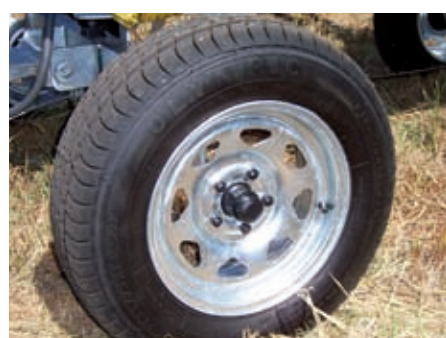
WHEELS & STUB AXLES: Heavy galvanised rims. Stub axle located on axle centre line for accurate steering and tracking.