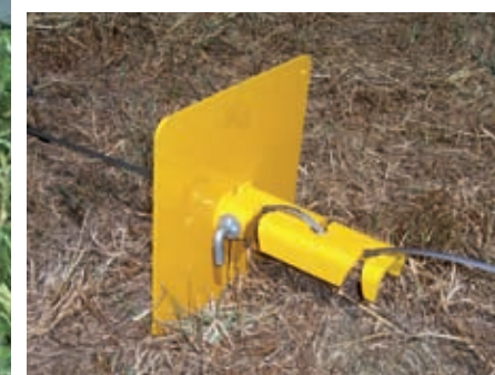
STOPPING PLATE: Positive locking, cable mounted, simple to fit and adjust for run length. Suits tractor or fixed anchor.