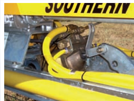
POWERFUL WATER MOTOR: Field proven water motor and drive mechanism for reliable service in the heaviest soil conditions.