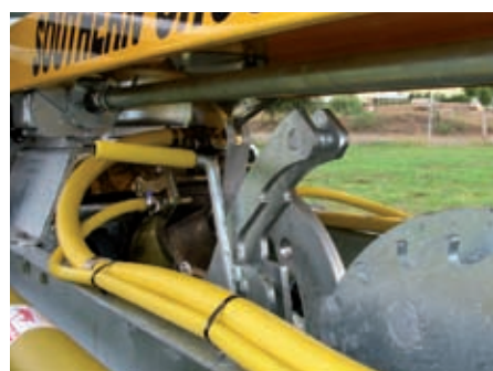
POSITIVE LOCK DRIVE ARMS: Cam action ensures positive engagement of drive arms in cable drum.