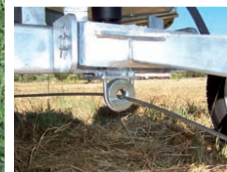
CABLE GUIDES: One piece hardened cable guides for extended cable life. Can be rotated for new guide surface.